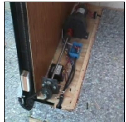
Drive Motor & Brain Box