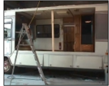
Side Wall Cut Out

For more information contact RV Interiors, 1215 W Houston Ave., Gilbert AZ, 85233, 888-844-2752